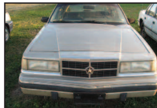
1989 Dodge Dynasty, 4-door, auto, 129k miles, dependable