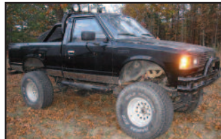
1982 Nissan pickup, 4x4, auto, lift kit, 150k miles, extra lg wheels