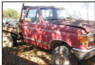
1986 Ford F-250 flatbed, 4x4, gas, with hydraulic bale bed, 4-speed, 114k miles