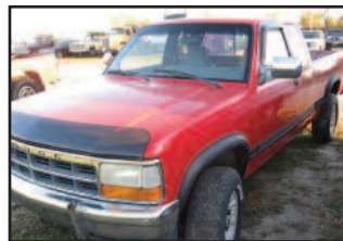
1995 Dodge Dakota, extended cab, 4x4, 5-speed, 192k miles