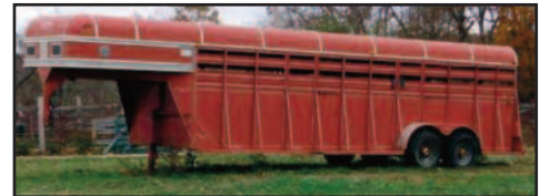
2002 Bonanza gooseneck stock combo trailer, two dividing gates, working lights & latches