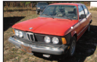
1981 BMW 320i, 129k miles, 2-door, runs, good project car