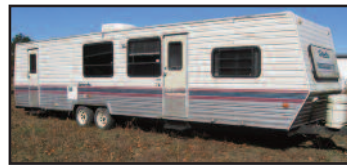
1992 32-ft travel trailer, Mallard Sprinter, good shape