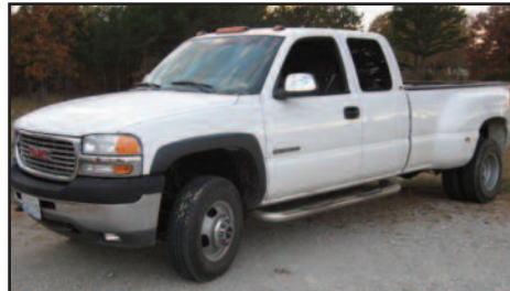
2001 GMC 1-ton Dually

4x4, auto, ext. cab, 6.0 engine, new tires, 73k miles, gooseneck hitch, extra steel gas tank, extra clean, one owner, excellent condition