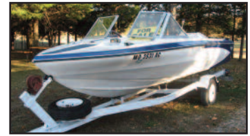
1972 Glastron 17-foot boat with trailer, 4-cylinder Volvo inboard engine, has been redone, runs good