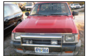
1989 Mazda pickup, 4x4, 5-speed, 167k miles

Plus many new wheels, parts, accessories, and other vehicles not available at press time