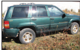
1998 Jeep Grand Cherokee Ltd, 4x4, 120k miles, auto, new tires, needs computer

4x4, auto, ext. cab, 6.0 engine, new tires, 73k miles, gooseneck hitch, extra steel gas tank, extra clean, one owner, excellent condition