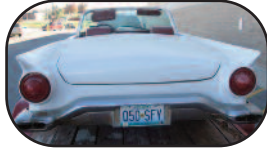
'57 Ford T-Bird conversion